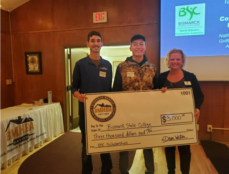
The Bismarck Mandan Home Builders Association recently awarded $3,000 in Student Scholarships.